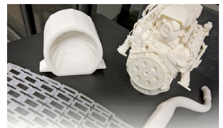
These prototype parts were made with 3D printers at General Motors' tech center in Warren, Michigan.

Automakers and suppliers are on the cusp of revolutionary change through their growing use of 3D printing, a technology that can make custom parts on demand and has the potential to mass-produce parts.